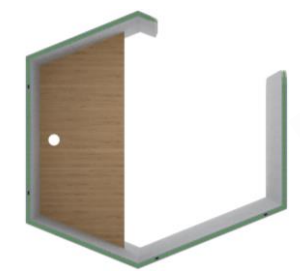
Bubble - 1726 L x 1402 D