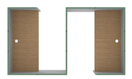
Helix – 2964 L x 1700 D