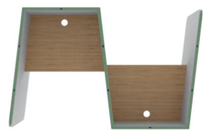
Dock - 2208 L x 1360 D